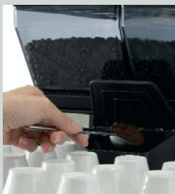
Manual ground coffee (decaf) box