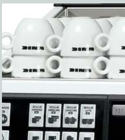
Large cup warmer built-in