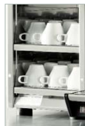
Cup Warmer Module