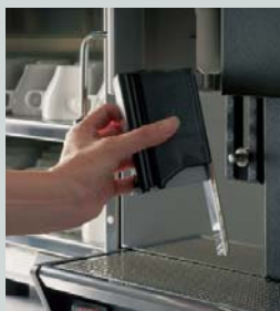
Easily removable coffee spout for cleaning