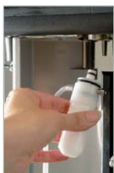
Integrated cappuccinatore device