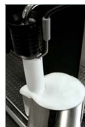
Steam Air ® thermo-controlled autofrother