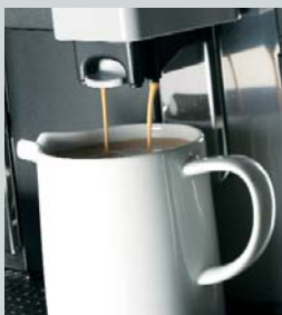
Coffee spout with adjustable height 80-170 mm