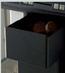
Dry coffee grounds drawer with electronic overfill safeguard