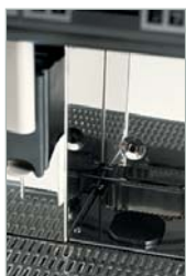
Coffee grounds direct chute discharge