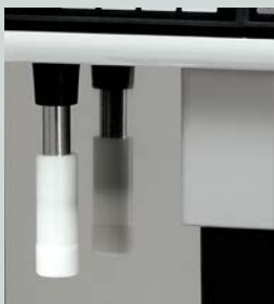
Telescopic hot water outlet