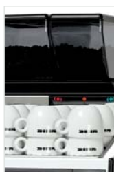
Second grinder with bean hopper capacity 1.2Kg