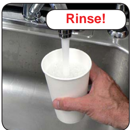
Repeat with clean water to rinse