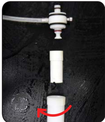
Unscrew the Foamer Cover Tube