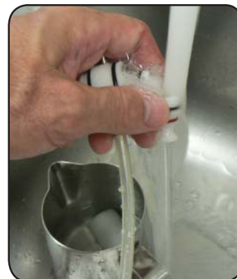
Clean foamer parts in sink