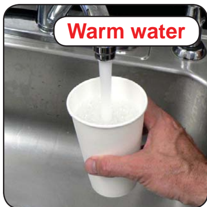
Fill a 16 oz cup with warm water