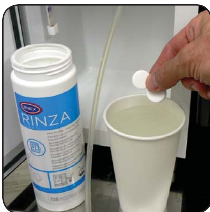
Insert 2 Rinza Tablets into the water