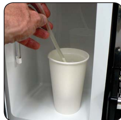
Insert the milk line into the cleaner