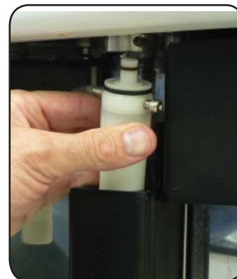
Re-assemble and re-install the Foamer and Spout