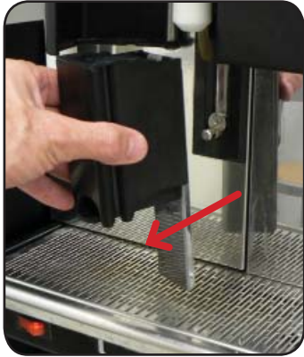
Remove the magnetically mounted spout