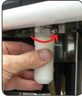
Unlock the Foamer by twisting it to the right