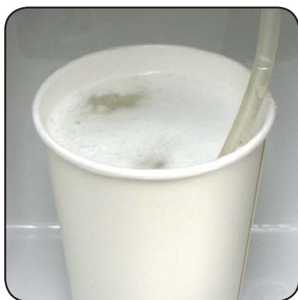
Wait 1 minute for the tablets to dissolve