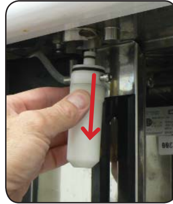
Remove the Foamer by pulling down