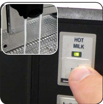
Run a milk cycle 4-5 times until cleaner cup is empty