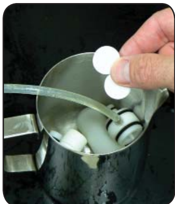
Soak the parts with tablet or liquid milk cleaner if needed