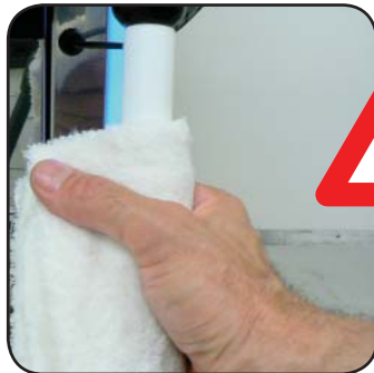
Remove the pitcher and wipe the wand and tip with a clean, damp towel.