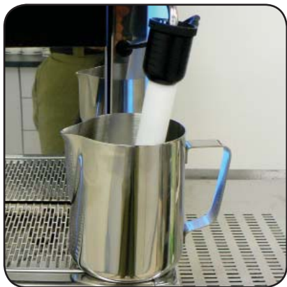
Steam Tip must be at least 1" below surface of milk

More air creates lighter foam with larger bubbles Less air creates denser foam with smaller bubbles