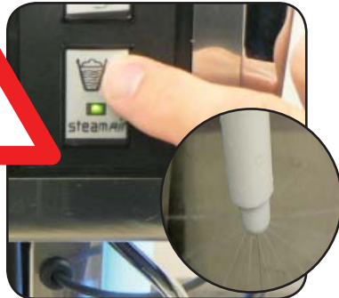
Press the Steam Button ON then OFF to purge

Steam or Water leaking from the air adjustment area? No Foam in milk?