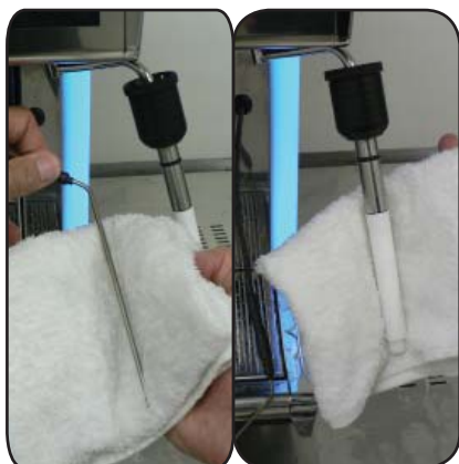
Wipe Temperature Probe and Inner wand