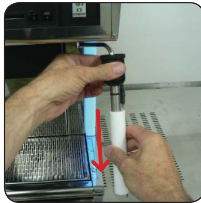
Remove Outer wand