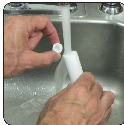
Clean Outer Wand and Steam Tip in sink