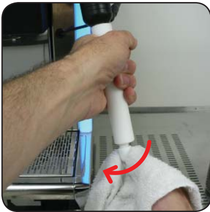
Uncrew Steam Tip