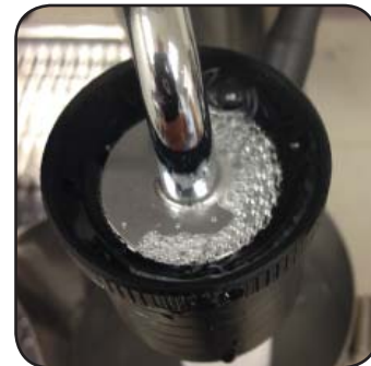
Steam tip is clogged with milk See next page for cleaning instructions

Steam or Water leaking from the air adjustment area? No Foam in milk?