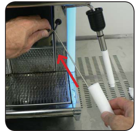
Remove Temperature Probe