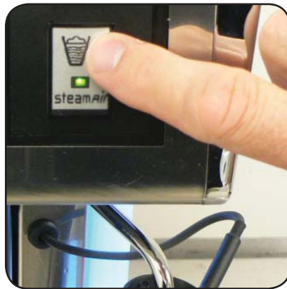
Press SteamAir Button Steam will automatically shut OFF at the pre-set temperature